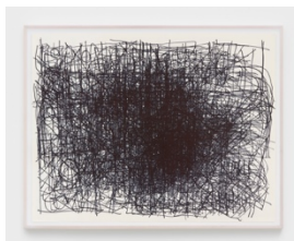
Untitled (Central dense black lines, DM 401), 2013 Acrylic and ink on paper 22 x 30 inches DMI135 $4,000