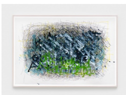
Untitled (DM 1389) , 2020 Acrylic and ink on paper 30.5 x 44 inches DMI173 $10,000