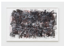
Untitled (DM 322), 2018 Acrylic and ink on paper 55.5 x 89.75 inches DMI161 $25,000