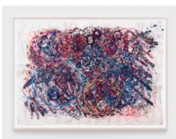
Untitled (DM 1394) , 2018 Acrylic and embroidery on fabric 20 x 28 inches DMI167 $5,000