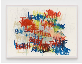
Untitled (DM 1186) , 2012 Acrylic and ink on paper 22 x 30 inches DMI150 $4,000