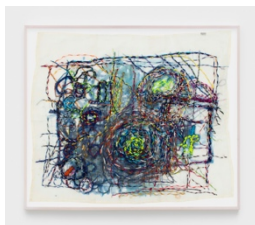
Untitled (DM 1094) , 2018 Acrylic and embroidery on fabric 28 x 31 inches DMI163 $5,000