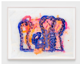
Untitled (DM 1100), 2018 Acrylic and embroidery on fabric 14.25 x 18 inches DMI165 $3,000