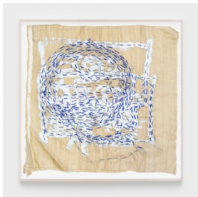
Untitled (DM 1140) , 2018 Acrylic and embroidery on fabric 21 x 21 inches DMI166 $4,000