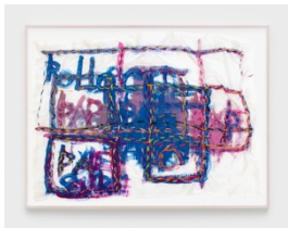
Untitled (DM 1096) , 2018 Acrylic and embroidery on fabric 23 x 31 inches DMI164 $5,000