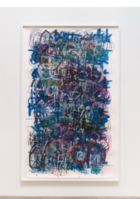
Untitled (DM 320) , 2018 Acrylic on paper 97 x 59.5 inches DMI175 $35,000