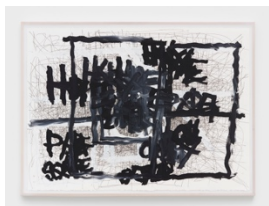
Untitled (Thick black lines over thin gray lines, DM 892), 2017 Acrylic and ink on canvas 22 x 30 inches DMI137 $4,000