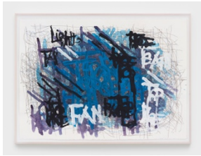
Untitled (DM 210) , 2013 Acrylic and ink on paper 22 x 30 inches DMI152 $4,000