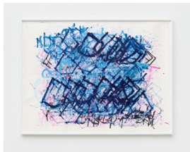
Untitled (DM 1193), 2019 Acrylic and ink on paper 55.5 x 74 inches DMI160 $25,000