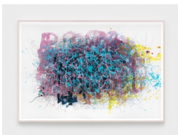
Untitled (DM 1388) , 2019 Acrylic and ink on paper 30.5 x 44 inches DMI172 $10,000