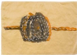
Untitled (DM 1027) , 2018 Acrylic and embroidery on fabric 12.5 x 18 inches DMI174 $3,000