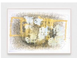
Untitled (DM 280) , 2016 Acrylic and ink on paper 29.5 x 41.5 inches DMI169 $10,000