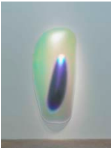
2. Hyper Ellipsoid (Black) 2016 Blow-molded acrylic 90 x 42 x 12 inches GCO101