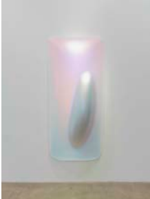
1. Mega Rectanglopoid (Silver) 2016 Blow-molded acrylic 90 x 42 x 12 inches GCO100