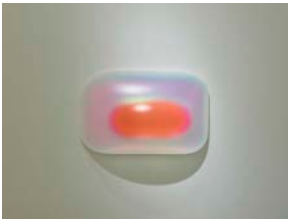
10. Ovoid (Iridescent Orange) 2016 Blow-molded acrylic 15 x 23 x 8 inches GCO109