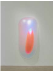
4. Ultra Spheroid (Orange) 2016 Blow-molded acrylic 90 x 42 x 12 inches GCO103