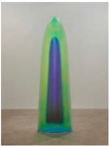
3. Untitled (Monolith Black) 2016 Blow-molded acrylic 111 x 34 x 24 inches GCO102