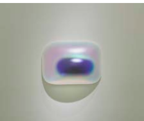
12. Ovoid (Iridescent Black) 2016 Blow-molded acrylic 15 x 23 x 8 inches GCO111