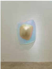
11. Skewed Square (Gold) 2016 Blow-molded acrylic 54 x 41 x 12 inches GCO110