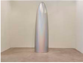
9. Untitled (Monolith Silver) 2016 Engineered carbon fiber 144 x 36 inches GCO108