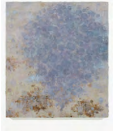
Charles Fine Inflatables VII , 2020 Oil, asphaltum, and alkyd resin on canvas 36 x 32 inches CFI189