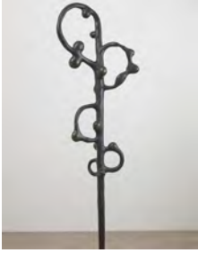
Charles Fine Parallel History I , 2014 Bronze 123 x 31 x 42 inches CFI186