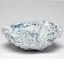
Jay Kvapil Bowl #1520 , 2019 Glazed ceramic 8 x 17 inches JKV194