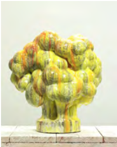
David Hicks Yellow Shrub, 2020 Glazed Terracotta 27 x 25 x 20 inches DHI101