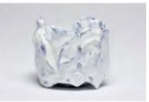
Jay Kvapil Bowl #1506 (Floe Series) , 2019 Glazed ceramic 4 ½ x 5 inches JKV162