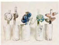
David Hicks Clipping (Brown), 2020 Glazed ceramic 24 x 5 x 5 ½ inches DHI107