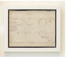
Joe Ray Art is Energy, 1979 Ink and tape on paper 11 x 14 inches JRA145