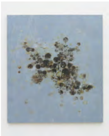
Charles Fine Centripetal Forces, 2020 Oil, asphaltum, and alkyd resin on canvas 70 x 79 inches CFI195