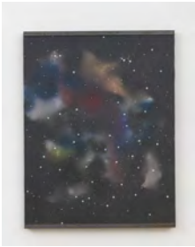
Joe Ray Nebul Fog No. 199, 1993 Acrylic and spray paint on canvas 45 \frac{3}{8} x 35 inches JRA102