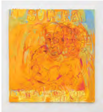
Sean McGaughey Sun Ra: Cosmic Tones for Mental Therapy , 2020 Oil and graphite on canvas 64 x 60 inches SMC107