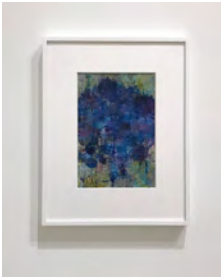
Charles Fine The Royal , 2020 Acrylic, acrylic ink, shellac ink, and gouache on paper 13 ¼ x 9 inches CFI193