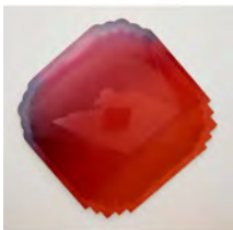
Roland Reiss Mirage , 1968 Fiberglass and resin 46 x 46 x 6 inches RRE159