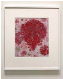
Charles Fine Inflatables VIII , 2020 Acrylic, acrylic ink, and asphaltum on vellum 13 ¾ x 12 inches CFI192