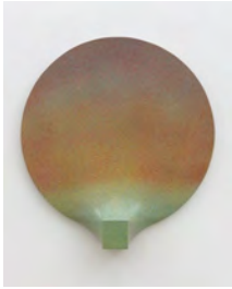
Roland Reiss Universal Language , 1967 Acrylic, fiberglass, and resin 42 ½ x 39 ½ x 6 ½ inches RRE212