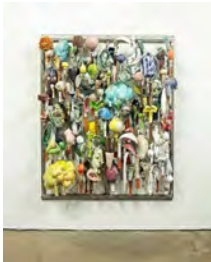
David Hicks Poly Panel , 2020 Glazed ceramic and stainless steel 78 x 64 x 16 inches DHI103