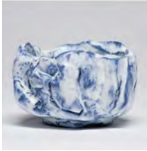
Jay Kvapil Bowl #1504 (Floe Series) , 2019 Glazed ceramic 3 ½ x 5 inches JKV160