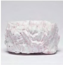
Jay Kvapil Bowl #1506-A (Floe Series) , 2019 Glazed ceramic 3 ½ x 6 inches JKV163