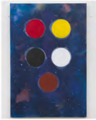
Joe Ray Red Yellow Black White and Burnt Sienna, 2020 Acrylic and vinyl on canvas 72 x 48 inches JRA154