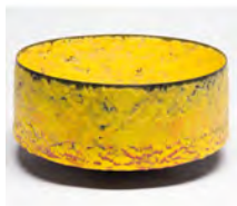
Jay Kvapil Bowl #1432 , 2019 Glazed ceramic 8 ½ x 18 ½ inches JKV191