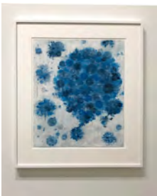
Charles Fine Inflatables IX , 2020 Acrylic, acrylic ink, and asphaltum on vellum 25 ⅛ x 21 ¼ inches CFI191