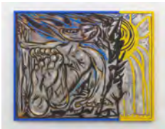
Daniel Gibson July 10, 2020, Man Walks into Desert, 2020 Oil on linen, oil on artist frame 37 ½ x 40 inches DGI114