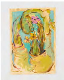
Sean McGaughey Healing Plant 1 , 2020 Oil, charcoal, and graphite on paper 30 x 22 inches SMC101