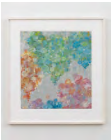
Charles Fine Inflatables X , 2020 Acrylic, ink, and watercolor on museum board 24 ⅛ x 22 ¼ inches CFI194