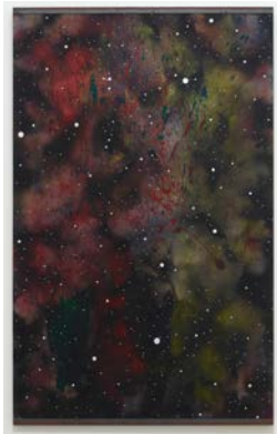
16. Becoming Ms Burton , 2017 Acrylic and spray paint on canvas 96 x 60 inches JRA119