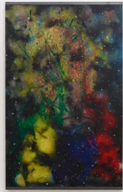
14. Flaming Star Nebula #3 , 2017 Acrylic and spray paint on canvas 96 x 60 inches JRA117