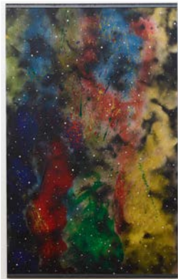
15. Flaming Star Nebula #4 , 2017 Acrylic and spray paint on canvas 96 x 60 inches JRA118