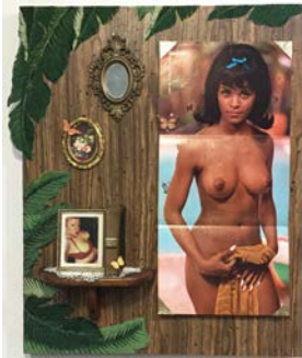
15. Genevieve Gagnard Sister, Sister , 2015 Inkjet print, contact paper, fabric, plastic, wood, mirror, metal, cotton, and paper on panel 30 x 25 ½ x 5 ½ inches GGA147