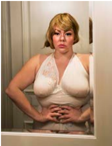
8. Genevieve Gagnard Her , 2015 Inkjet print 19 ¾ x 15 ¾ inches Ed. 3 (+ 2AP) GGA141