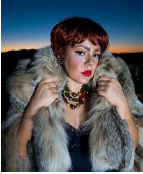
11. Genevieve Gagnard Priscilla , 2015 Inkjet print 24 x 20 inches Ed. 3 (+ 2AP) GGA135