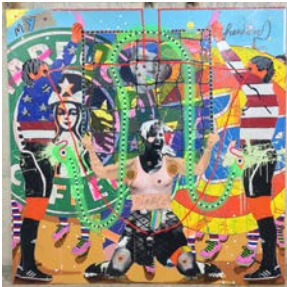
14. Michael Shultis Free the Nipple , 2015 Oil, acrylic, ink, color photo print, black and white photo print, colored vinyl, and shower curtain on disposed Robert Longo crate 80 x 80 inches MSH100