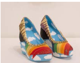
10. Genevieve Gagnard The "Head in the Clouds" Wedge , 2015 A pair of shoes 7 ½ x 9 x 9 inches GGA149