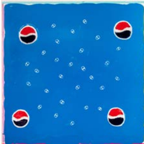
12. Jason Stopa Tabs (Pepsi) , 2015 Oil and enamel on canvas 72 x 72 inches JST101