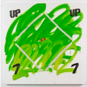
13. Jason Stopa Four Straws , 2015 Oil and enamel on canvas 36 x 36 inches JST100