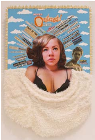
9. Genevieve Gagnard The Girl Next Door , 2015 Inkjet print, collage, paint, fabric, pencil, and shellac on panel 32 x 20 x 1 ½ inches GGA148